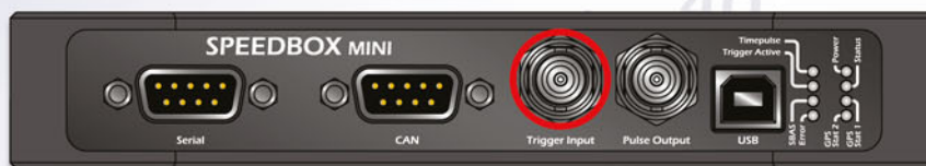
Fig 2. Trigger input location

Connect the output of the laser barrier to the trigger input on the SPEEDBOX INS: