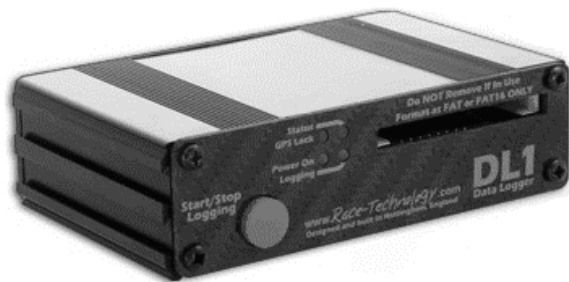
Figure 1:DL1 general arrangement

speeds, temperatures, pressures, lap times, sector times etc. The data is sampled 100 times per second and then stored onto the compact flash card in a format that the computer can read. Our software can then load and process the data and allow analysis of all aspects of the data, from lap times to speeds, temperatures, suspension movement, etc. To view data in real time the DL1 can be connected to the DASH1, DASH2, DASH3, VIDEO4 or VOB.